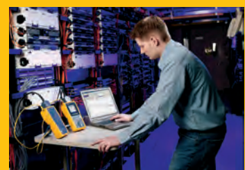
DTX-1800 with DTX 10 Gig Kit to test Alien Crosstalk performance