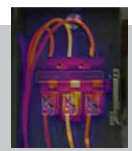
Three-phase AutoBlend Mode