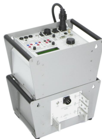
PCU1-SP and NLU5000

Where higher currents and powers are required for primary injection, 11kVA and 20kVA primary injection systems are available. The PCU1-SP and PCU2/E systems have separate control and loading units, allowing a wide range of load conditions to be covered with different loading units.