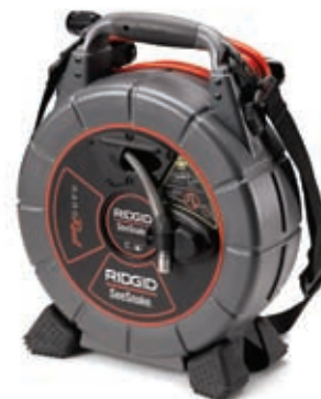
nanoReel Drum for SeeSnake® Monitors