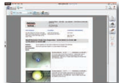
Report through SeeSnake® HQ™ Software