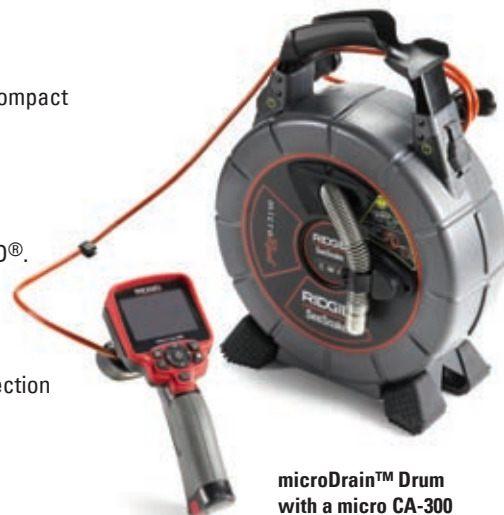
microDrain™ Drum with a micro CA-300

Buy a system (for example a microDrain™ cat 33133) and when you want to inspect a larger pipe you simply take out the inner drum and put a microReel™ inner drum (for example 35228) in the housing.