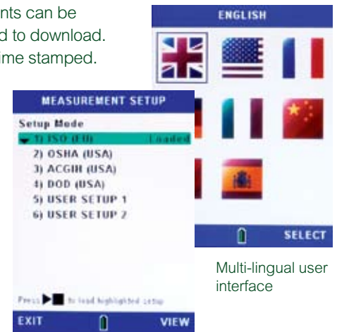
Multi-lingual user interface

When connected to a PC via the USB connection, the CEL-600 series acts like a memory card, so data files can be moved to a PC and easily reviewed without the need for proprietary software.