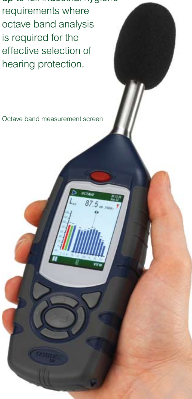
Octave band measurement screen

Different models are available depending on your requirements for use in general workplace noise measurements, up to full industrial hygiene requirements where octave band analysis is required for the effective selection of hearing protection.