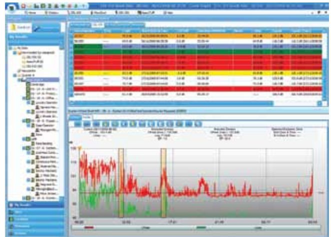
Tree style database of results with colour coding for exceeded noise action levels