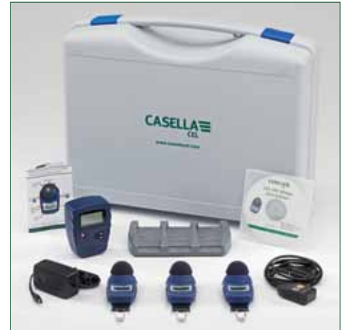
A typical measurement kit

For software to go with the d Badge kits, please refer to Casella Insight data sheet.