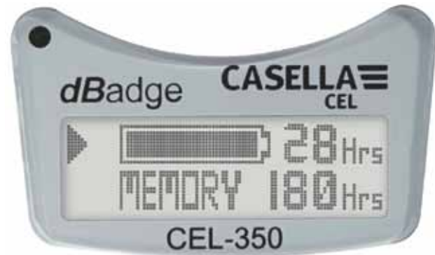
'Fuel gauge' display for memory and battery information

The dB Badge Series is the first compact noise badge product to be designed with a display. This internal display makes it easy to perform calibration, provides status information and shows key measured data. The dB Badge has a unique 'fuel gauge' to display memory and battery status, ensuring the exact remaining battery and memory capacity can be viewed on the display. Also a unique feature of the dB Badge is the alarm function. An ultra-bright LED on the dB Badge gives a visual indication of when exposure action levels have been exceeded by flashing at different rates. These action levels can be configured via the Insight software and used to instantly see if noise control or hearing protection measures are needed. The alarm function can be switched on or off via the dB Badge keys.