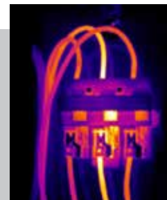
Three-phase Full Infrared