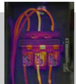
Three-phase AutoBlend Mode