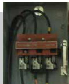
Three-phase Full Visible

Precisely blended visual and infrared images with crucial details to assist in identifying potential problems.